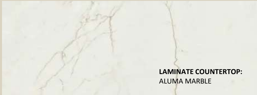
LAMINATE COUNTERTOP: ALUMA MARBLE