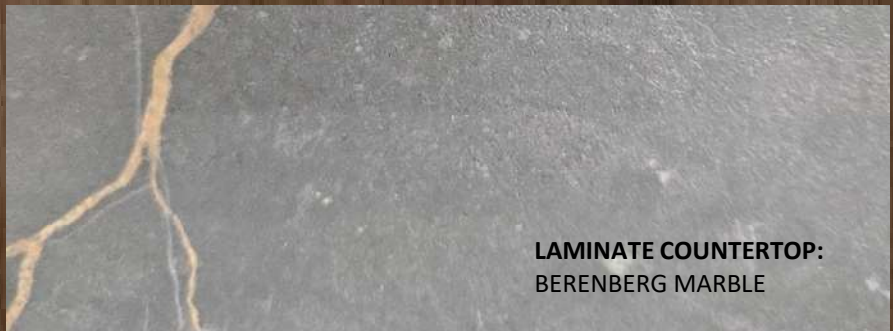
LAMINATE COUNTERTOP: BERENBERG MARBLE

*** SCREENS AND PRINTERS MAY DISTORT COLOURS ***